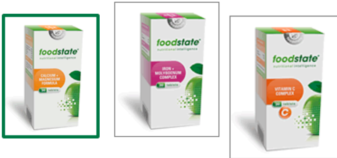
Vitamin C Human Absorption Study

FoodState® supplements are the only vitamins and minerals that are complexed in food. Scientific studies* indicate FoodState® vitamins and minerals are better absorbed, retained and utilised in your body's cells, unlike other brands that are not complexed in food.